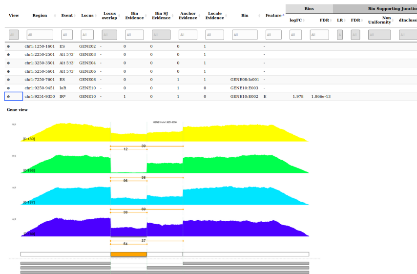
Figure 9: Example of integrate signal DataTable report

The result is an HTML page, where you can easily browse the tables stored in an ASpliIntegratedSignals object.